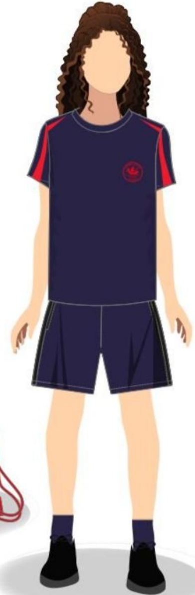
P.E. Bag: Red with Logo